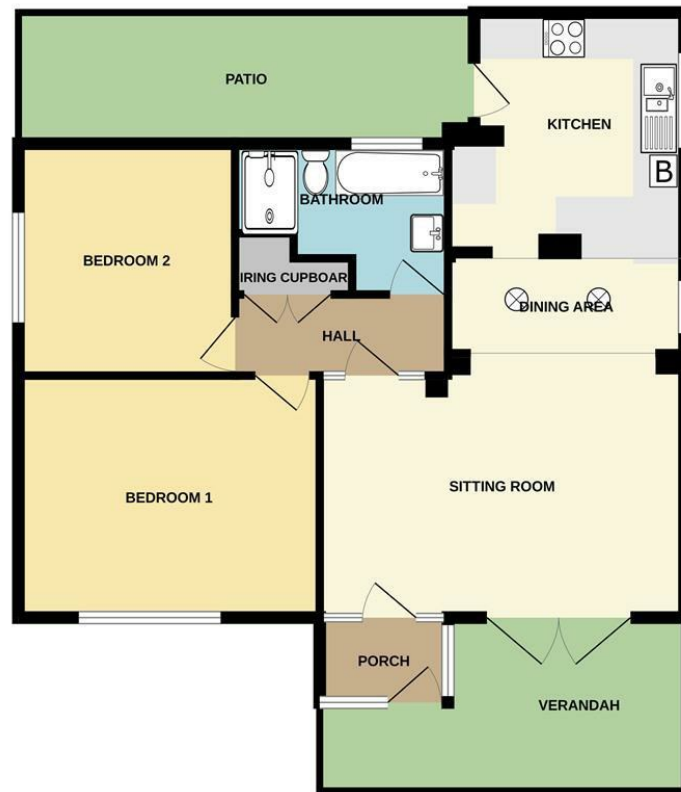
GROUND FLOOR 753 sq.ft. (69.9 sq.m.) approx.

TOTAL FLOOR AREA: 753 sq.ft. (69.9 sq.m.) approx. Whilst every attempt has been made to ensure the accuracy of the floorplan contained here, measurements of doors, windows, rooms and any other items are approximate and no responsibility is taken for any error, omission or mis-statement. This plan is for illustrative purposes only and should be used as such by any prospective purchaser. The services, systems and appliances shown have not been tested and no guarantee as to their operability or efficiency can be given. Made with Metropix ©2023